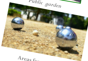
Areas for petanque